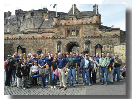
Scotland Tour Group, Edinburgh Castle