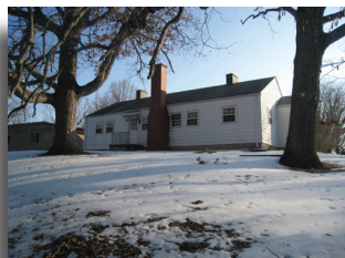
The Griffin House on S 9th St

After many years, however, owning a residential property either for use of the pipe band, or for use as a rental property proved to be both an extra expense and a distraction from the 42nd's core mission of performing the music of the pipes, fifes, and drums and preserving Scottish culture in and around Lafayette.