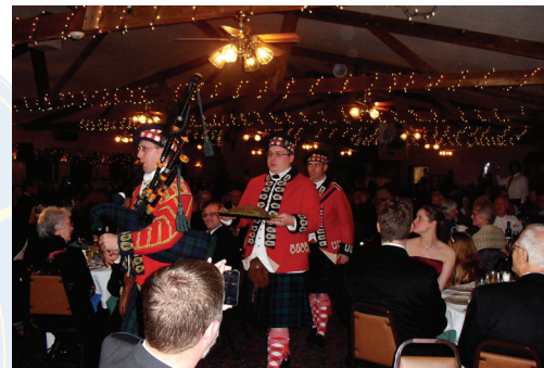
Presentation of the Haggis 2011