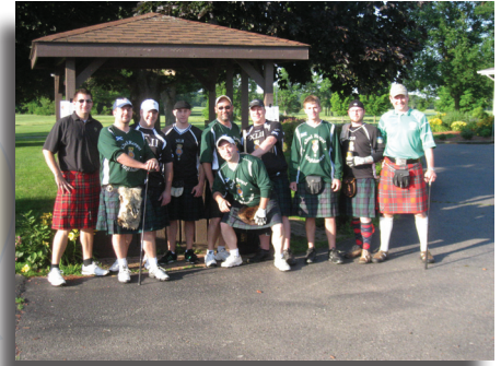
Kilted Participants at 2011 Golf Outing

The event was made possible through the generous support of several sponsors and donors of prizes for the event. Thank you for your generosity - the event wouldn't be possible without your support!