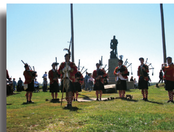
On the field at Fort Massac, in front of the George Rogers Clark monument