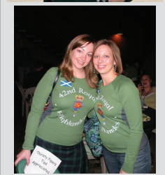
Men's and Women's 42nd Highlander Jerseys

We recognize that supporters of the 42nd want to show their Highlander spirit wherever they go, and in 2011, the 42nd's merchandising efforts have picked up the pace to meet this need.