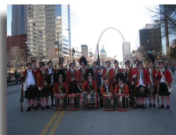
"Best Irish Marching Unit" 2011

Fall of 2011 saw busy months of September and October for the band. In September, the band attended the Trail of Courage in Rochester, IN - a traditional site for the band to perform in Tom Griffin's home Fulton County. The band performed two shows a day, marched a candlelight parade through the grounds with members of the River Valley Colonials Fife and Drum Corps, and even dabbled in naval activities! This year, we are proud to report that 42nd members won the annual throwing accuracy competition, taking the traveling trophy back from RVC!