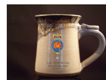
42nd Ceramic Mug

Order online or visit us at the Forfar Bridie booth at the Feast to get your mug!